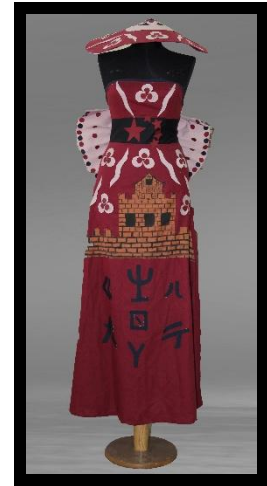
Photo12. China theme dress