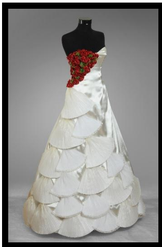
Photo 7. Nature theme dress

This section provides examples of clothing made using the technique of draping.