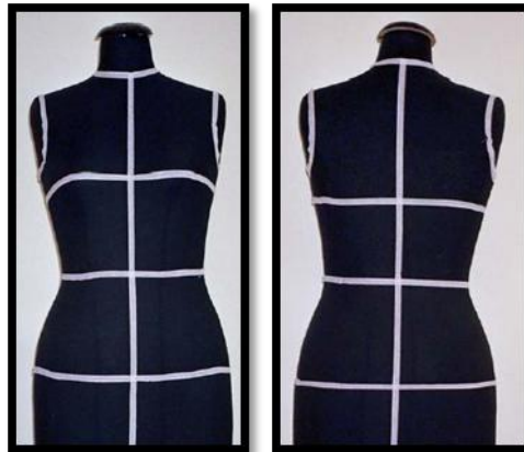
Photo 4. Draping front and rear view of the mannequin prepared (megep, 2006).