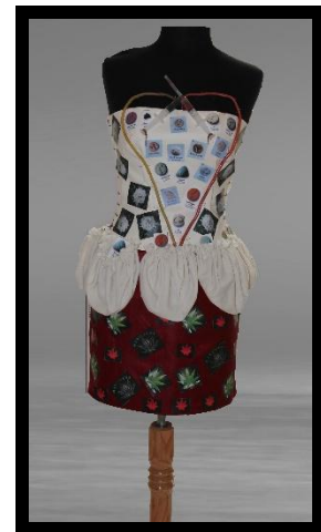
Photo 9. Youth and emotions theme dress