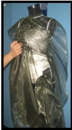
Photo 5. Draped bustier with technical applications