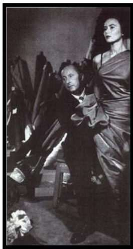
Photo 1. Christian Dior on live mannequins draped (Seeling 2000: 254).

Draping, fabric and body is about working together, but hard to master a skill and therefore is respected. Artistry, the minimum cut shape and refurbishment, body shape and beautify or Basing (Jones, 2009: 150). In this context Alaia Azzedin Remember sculptor to study, but his career fashion as to maintain and clothes while preparing the live mannequins use the value of emphasizing the best promise "one of the body's stand on and I materials, other dress I to the body for seating a living on the body I have to try." Through the Word draping application to the importance of alluded to (Mee, Purdy, 1987:1).