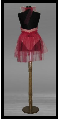
Photo 10. Youth and emotions theme dress