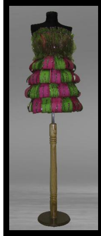
Photo11. Youth and emotions theme dress