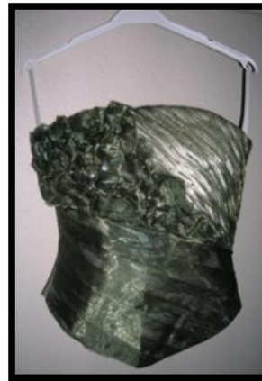
Photo 6. The finished appearance bustier