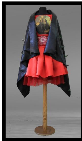
Photo 8. Atatürk and Republic theme dress